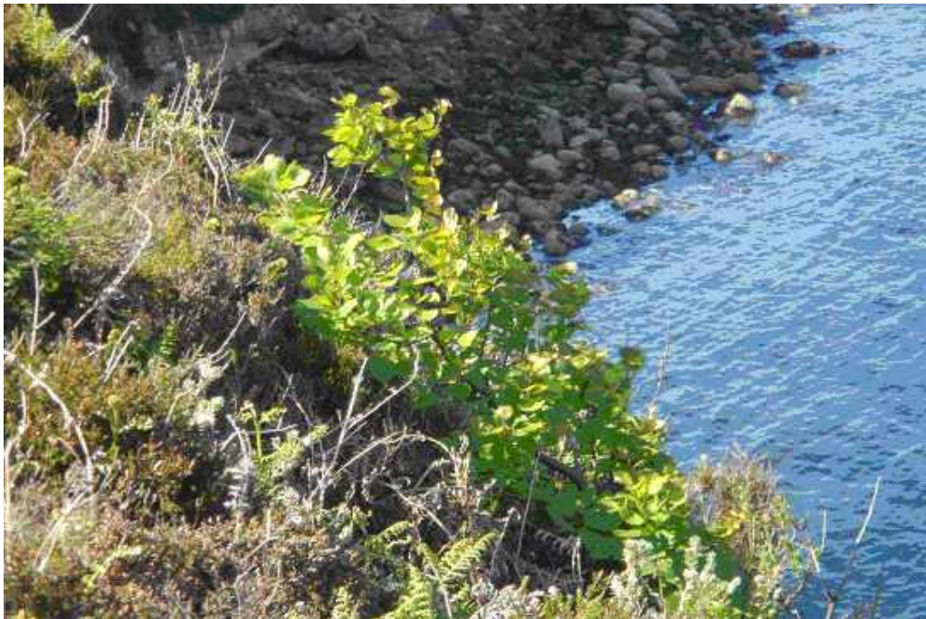
Fig 2 Clifftop Aspen near Outer Sinigoe

At most locations the trees were small (generally less than one metre in height) and of stunted appearance. Substantial trees having the characteristic Aspen shape (upright with long slender bole) were found only at Courtfall (up to 3 metres tall) (Fig 3) and at Burifa Hill (one dead tree 1.6 metres tall).