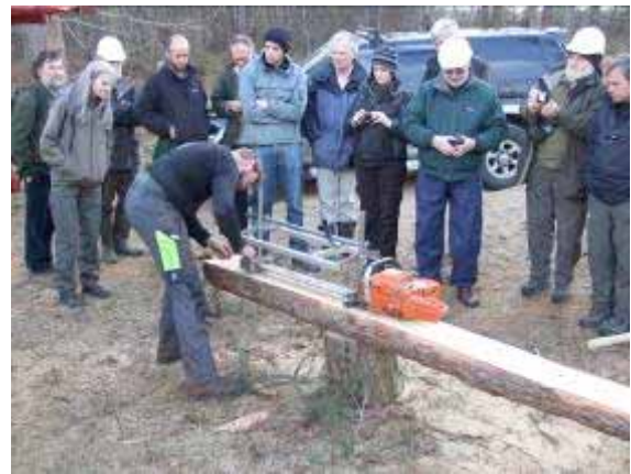
Participation in group training days at Drumnadrochit, and at Kirkhill & Bunchrew Community Woodland