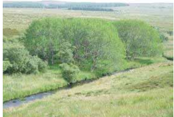
Biodiversity Group volunteers in Aspen at Tacher wood, Caithness