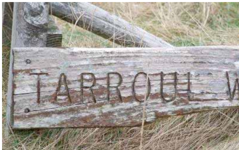
Advice and Support to Caithness woodland owners