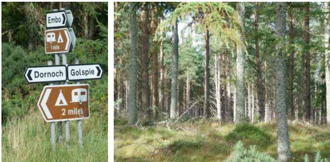
Supporting Embo Trust with woodland buyout plans

We have also continued our efforts to protect and expand the existing tree gene pool in Caithness and Sutherland. This has involved some seed collection, supporting other groups in doing this and continuing to work with local nurseries to enhance their ability to supply local provenance plants.