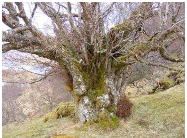
Ancient Alder Pollards, Foinaven